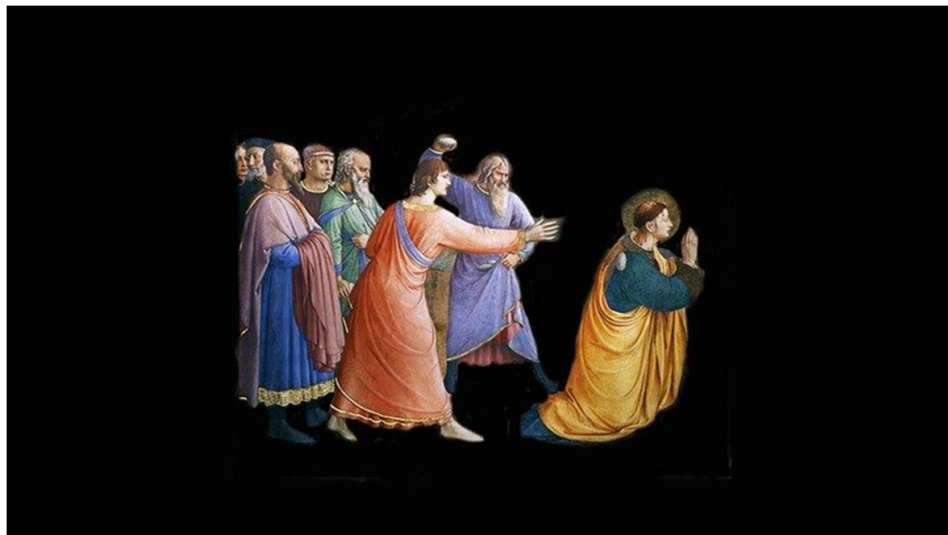
can Apostolic Palace, Niccoline Chapel (Pope Nicholas V 1447-1455.

Fra Giovanni da Fiesole known as Fra Angelico (1395-1455), Capture and Stoning of Saint Stephen, lunette of the upper portion of the Stories of Saint Stephen and Saint Lawrence, fresco, 1448-1449, Vati-